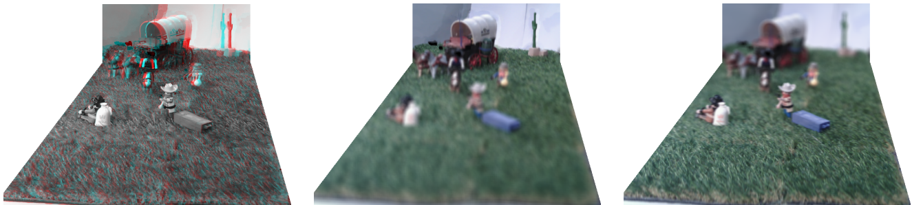
Figure 1: Virtual stereo pair with user-adjustable inter-axial distance (left), synthetic aperture renderings (center, right)